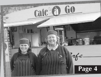
Boat House Café on the Esplanade Page 4