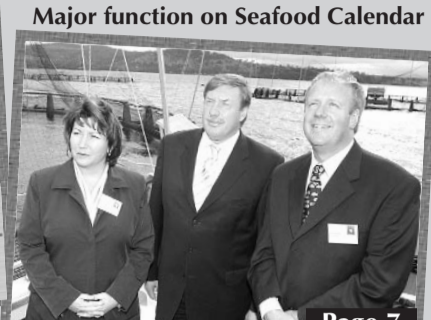
Major function on Seafood Calendar Page 7