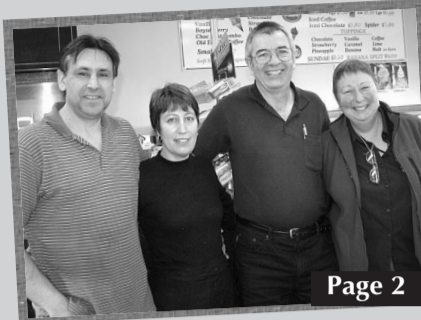
Popular Lito's Café changes hands Page 2